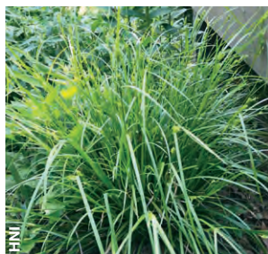
Eastern Narrowleaf Sedge Carex amphibola