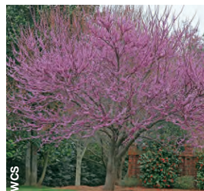
Eastern Redbud Cercis canadensis