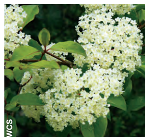
Smooth Black Haw Viburnum Viburnum prunifolium