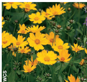
Lobed Tickseed Coreopsis auriculata