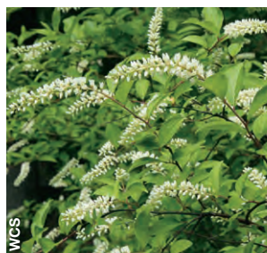
Virginia Sweetspire Itea virginica