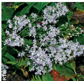
Heartleaf Aster Symphyotrichum cordifolium

For the companion booklet to these plants, visit: ncwildflower.org