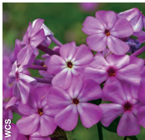
Carolina Phlox Phlox carolina