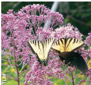
Hollow Joe-Pye Weed Eutrochium fistulosum