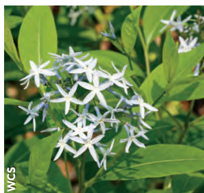
Eastern Bluestar Amsonia tabernaemontana