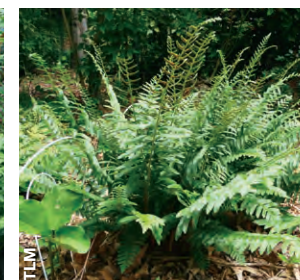
Christmas Fern Polystichum acrostichoides