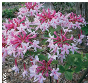
Pinxterbloom Azalea Rhododendron periclymenoides