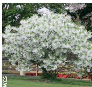
American Fringetree Chionanthus virginicus