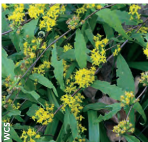
Blue Stemmed Goldenrod Solidago caesia