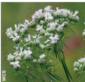
Slender Mountain-mint Pycnanthemum tenuifolium