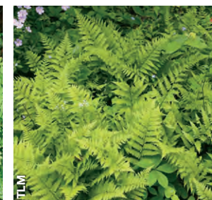
Southern Lady Fern Athyrium asplenoides