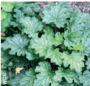
American Alumroot Heuchera americana