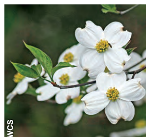
Flowering Dogwood Cornus florida