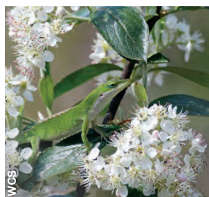
Red Chokeberry Aronia arbutifolia