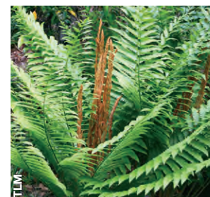
Cinnamon Fern Osmundastrum cinnamomeum