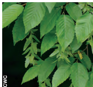
American Hornbeam Carpinus caroliniana