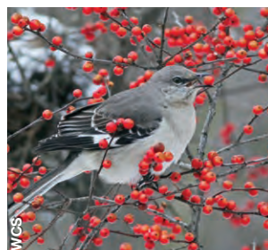
Common Winterberry Ilex verticillata