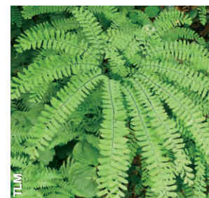
Northern Maidenhair Fern Adiantum pedatum