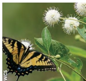
Buttonbush Cephalanthus occidentalis