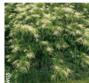
Sourwood Oxydendrum arboreum