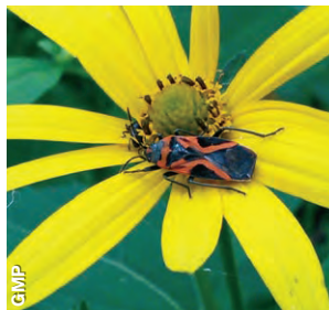
Smooth Oxeye Heliopsis helianthoides