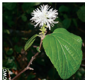
Large Witch-alder Fothergilla major