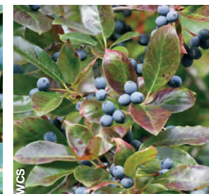
Blackgum Nyssa sylvatica