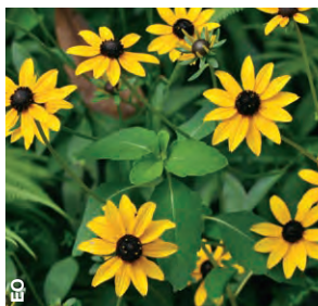
Orange Coneflower Rudbeckia fulgida