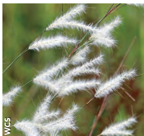
Splitbeard Bluestem Andropogon ternarius