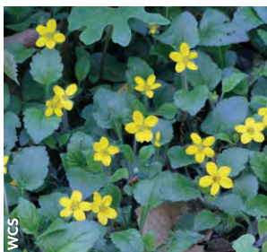
Green-and-gold Chrysogonum virginianum