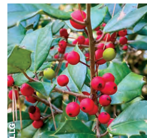
American Holly Ilex opaca