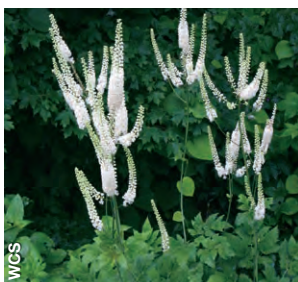
Black Cohosh Actaea racemosa