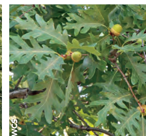
White Oak Quercus alba