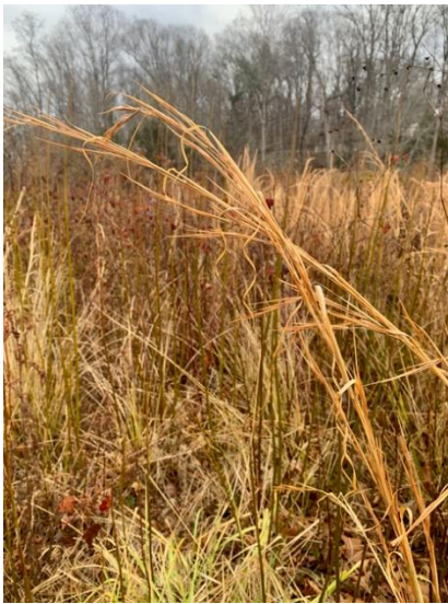
Andropogon virginicus

Groundsel-tree, Baccharis halimifolia (in fruit). Roadsides, 11/1/23.