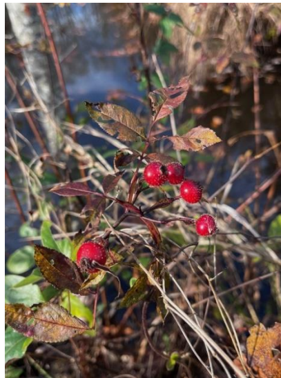
Rosa palustris AWF