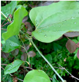
Whiteleaf greenbrier Smilax glauca

Catawba Rhododendron, Rhododendron catawbiense (in bloom). Hanging Rock State Park, 5/17/22 (Michel Gaskin).