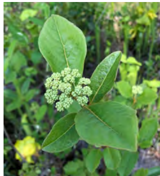
Wild Raisin Viburnum nudum